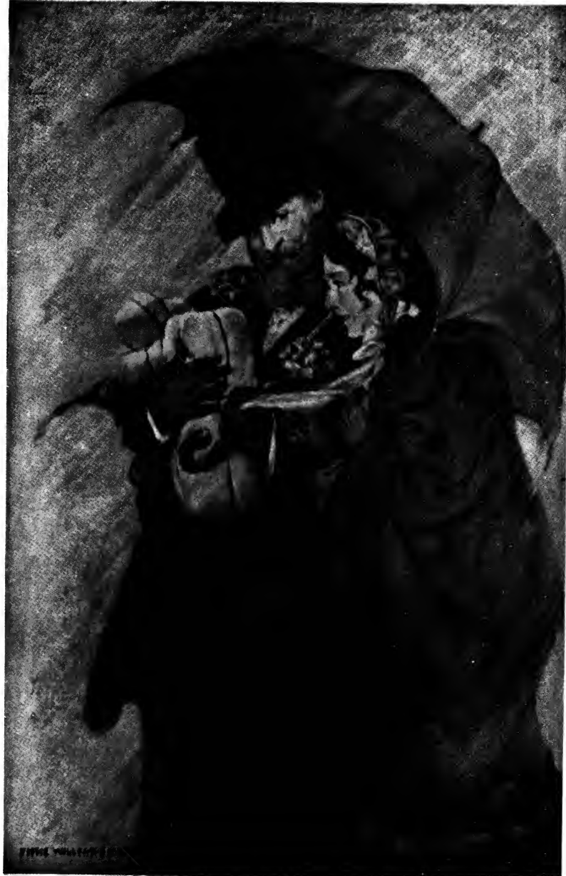
Passers-by probably thought them a pair of harmless lunatics. Page 506.